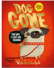
Dog Gone By Rob Biddulph