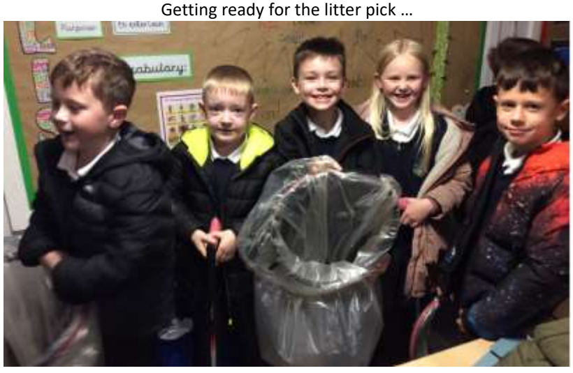
in the school grounds for 14 Days of Kindness.

Geography: Our rivers topic was brought to life as we had a virtual experience in class with an interactive story on the headsets.